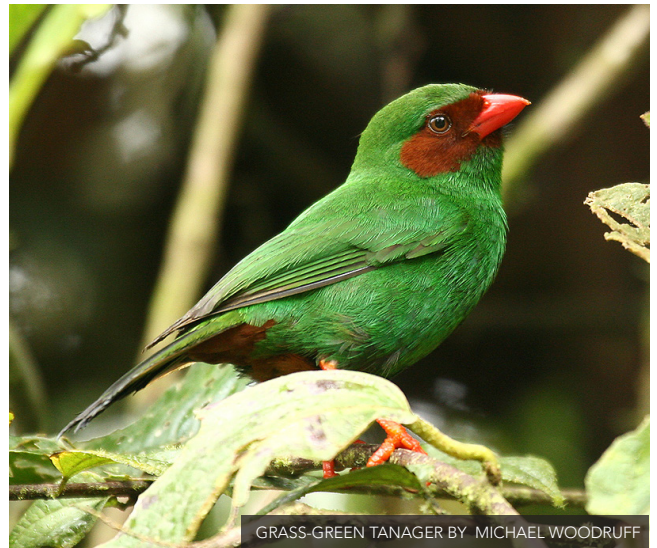
GRASS-GREEN TANAGER

Please join our Facebook page and share photos of your program. Visit us at www.facebook.com/holbrooktravel . We hope to hear from you.