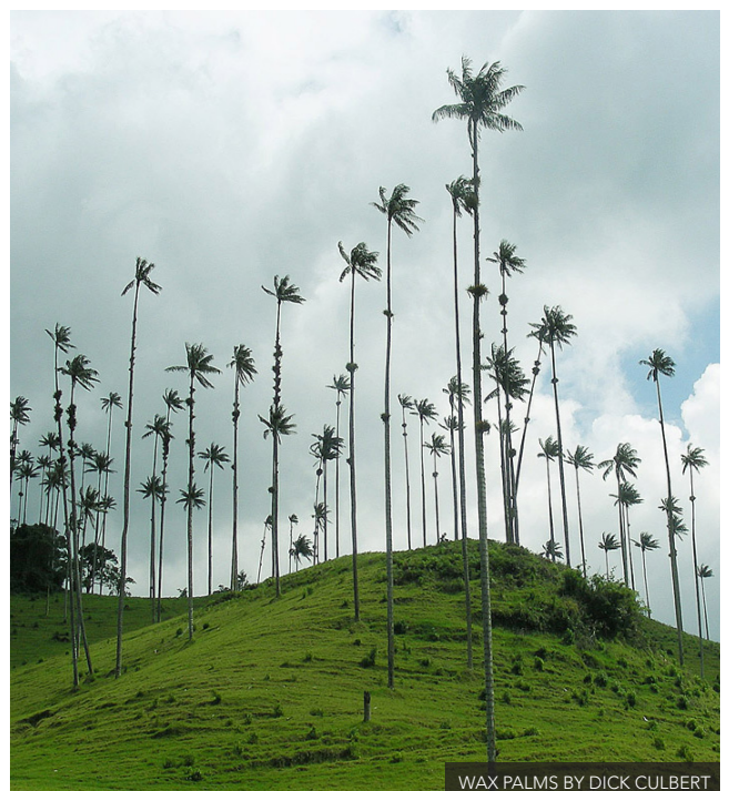
WAX PALMS BY DICK CULBERT