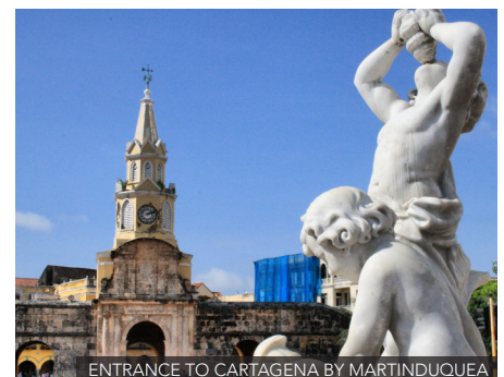
ENTRANCE TO CARTAGENA BY MARTINDUQUEA